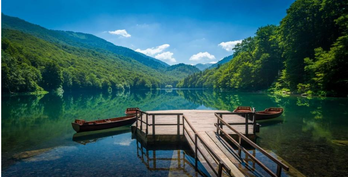
NATIONAL PARC BIOGRADSKA GORA