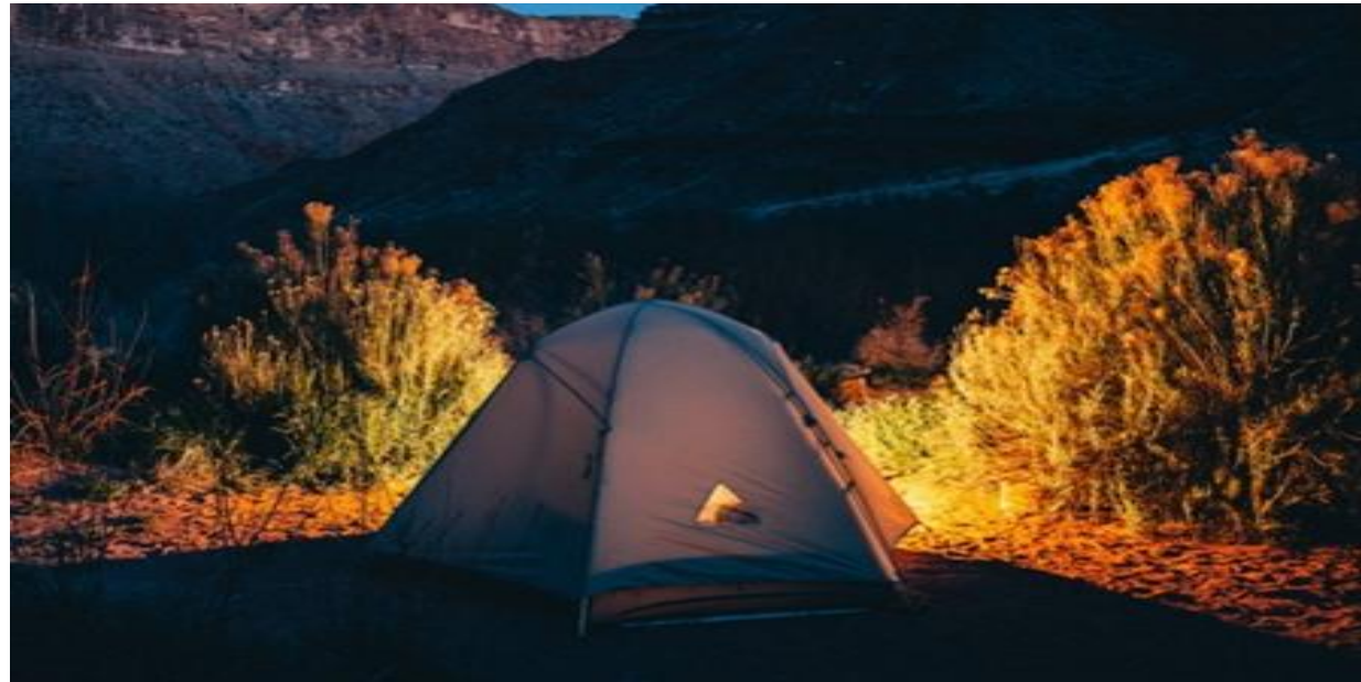
CAMPING – ECO CAMPING