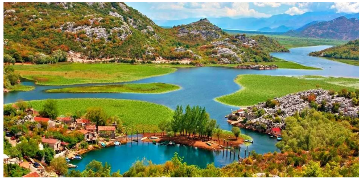
NATIONAL PARC SKADAR LAKE