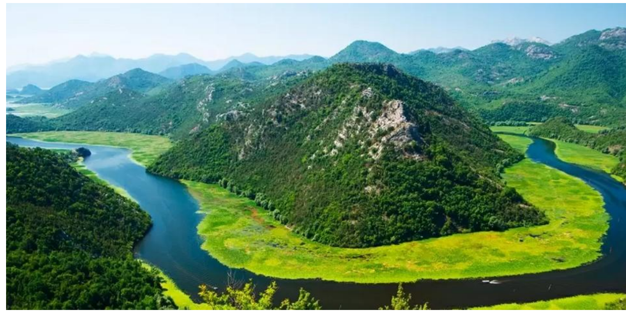
CRNOJEVIĆA RIVER CRUISING