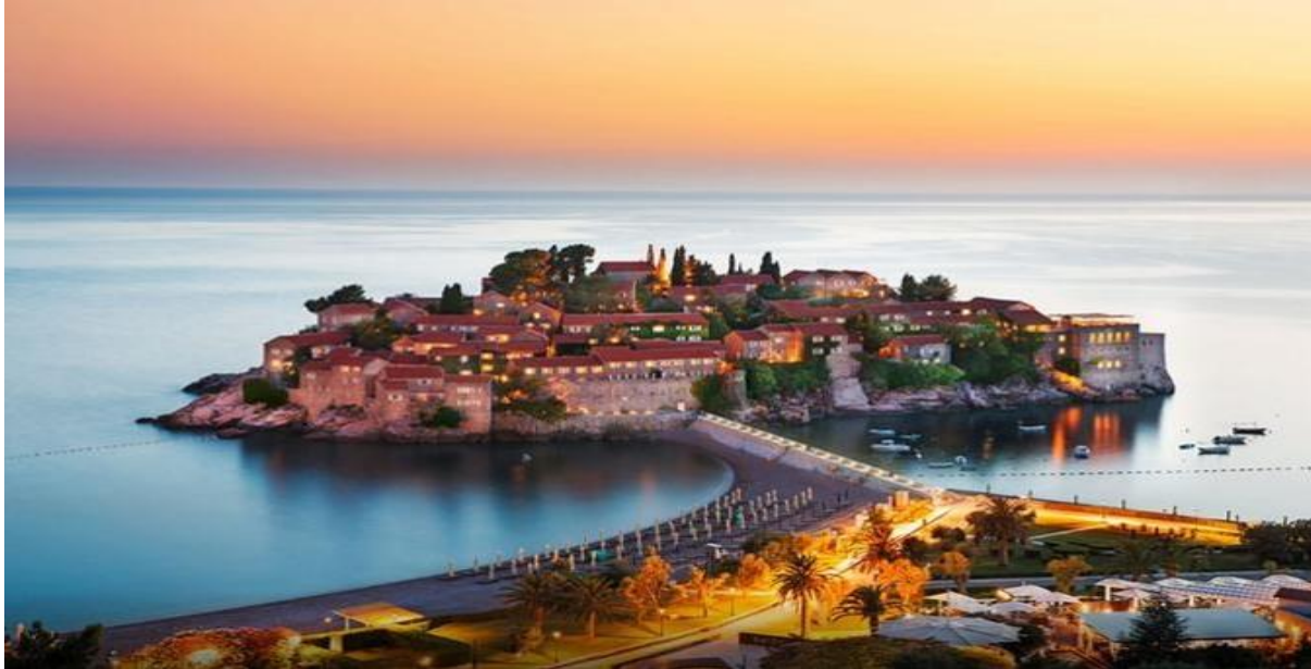
BUDVA AND SVETI STEFAN