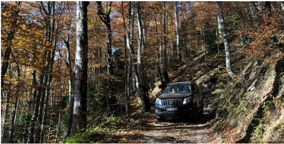
JEEP AND QUAD SAFARI