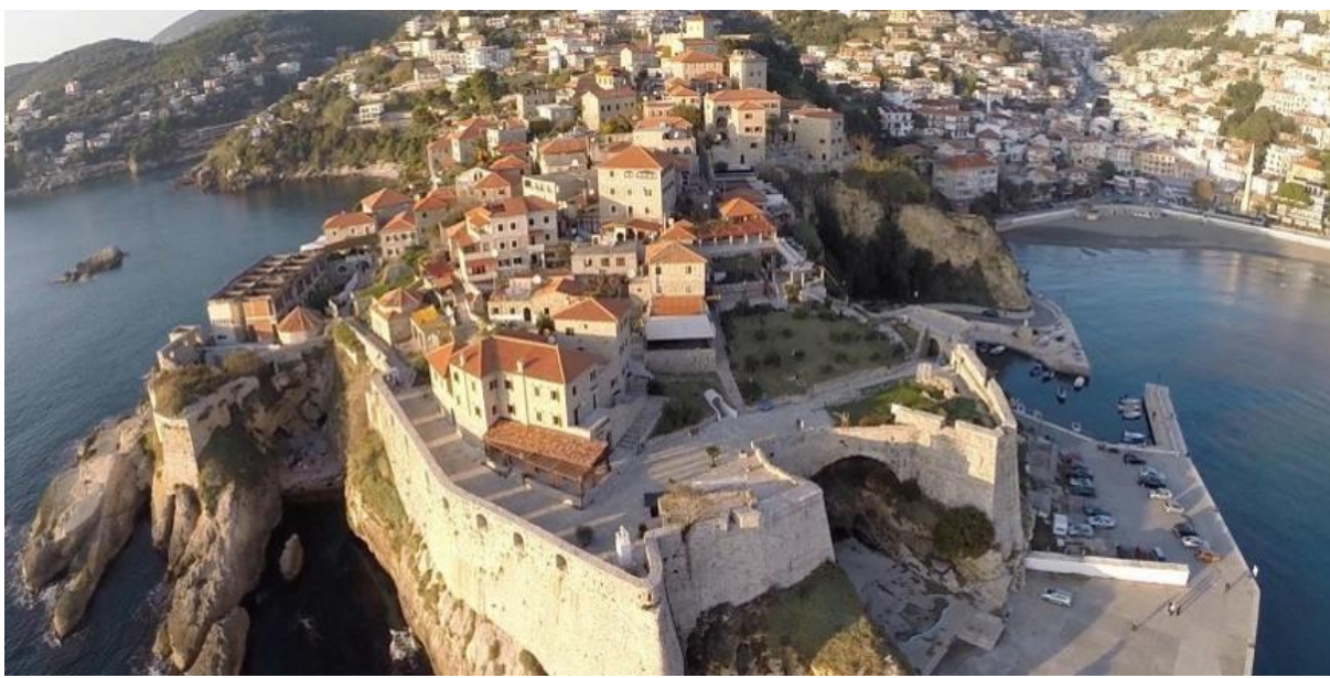
BAR AND ULCINJ AND OLIVE TOUR