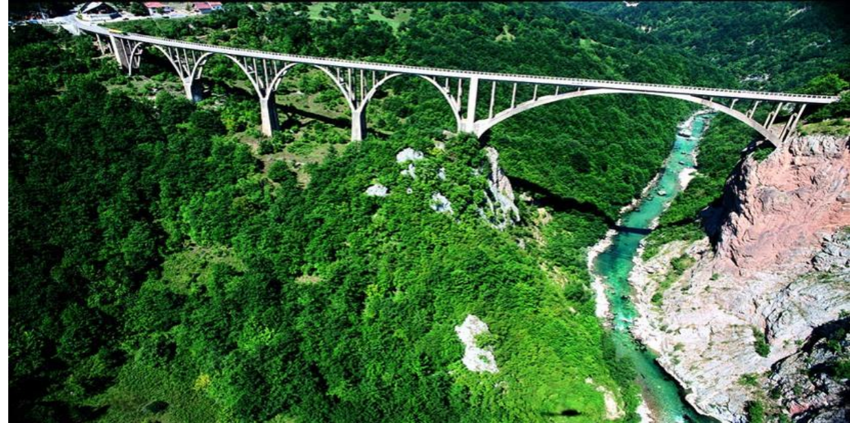
NATIONAL PARC DURMITOR