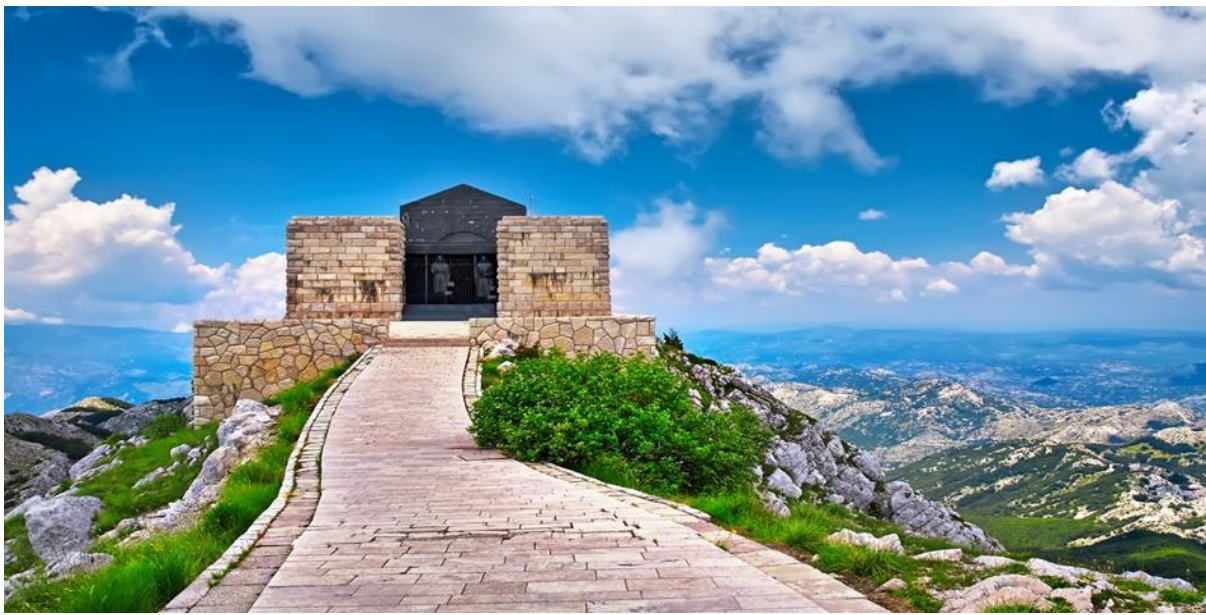
NATIONAL PARC LOVČEN AND CETINJE