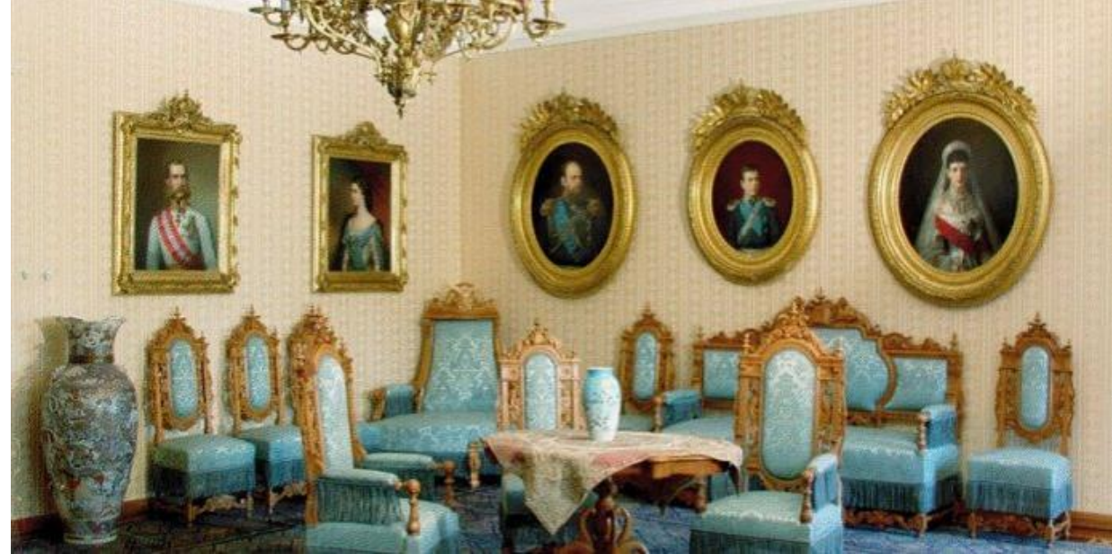
MUSEUMS AND GALERIES