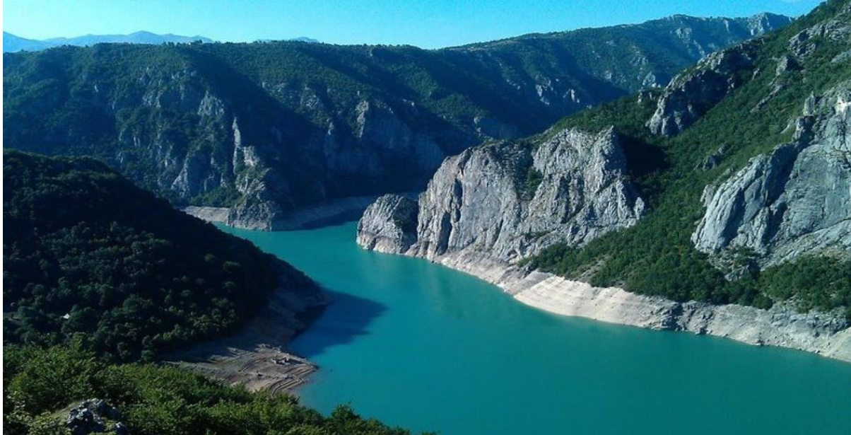
PIVA LAKE CRUISING